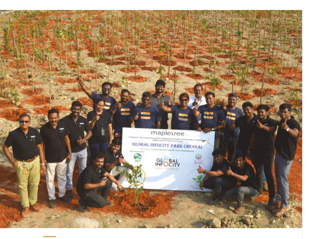
In Chennai, 2,000 trees were planted in a plot of land previously filled with concrete waste, hume pipes and labour sheds.

doors at all basement lift lobbies and anti-skid tape for all block staircases. These enhancements make GIPC universally accessible and compliant with Harmonised Guidelines<sup>2</sup>.