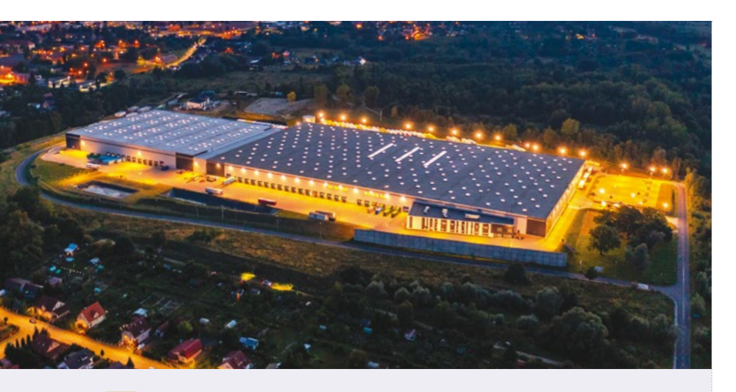
Lubuskie 2 Building, located in Krosno (Poland), had a building extension constructed in June 2023.